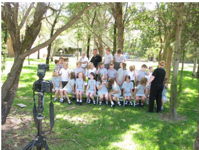
3B are looking good!

Student and staff photographs are being taken today by Master School Portraits. Photography started at 8.30am and our aim, apart from taking great school photos was to include our Region Swimmers before they had to leave for Maitland.